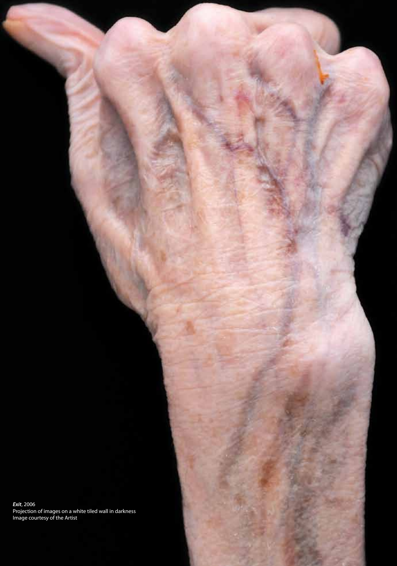
Exit , 2006 Projection of images on a white tiled wall in darkness