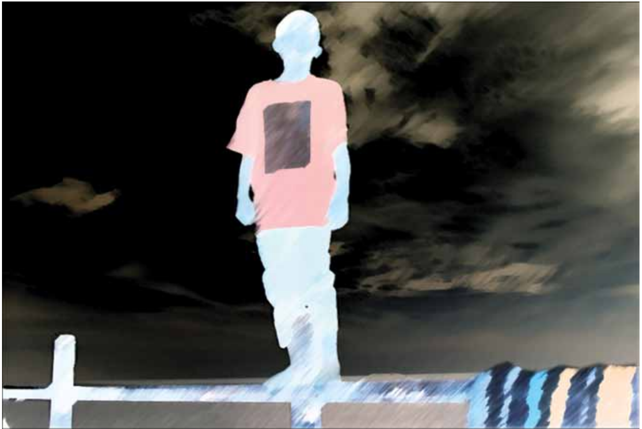
End of Days, 2003

Digital editing. Light boxes installation placed at random in a complete darkened room