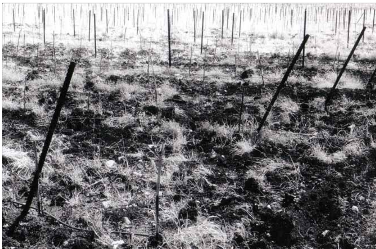
Search, 1997 B&W Infra Red Photography

Jerusalem, a city that he describes as being in exile itself, was as much the undoing of him as it was his making. He discovered through it not only the burden of its own lack of belonging, but the reality that in the city’s exile was but a sliver of a shadow of his life. “Jean Baudrillard said the world has been transformed to an image, we live