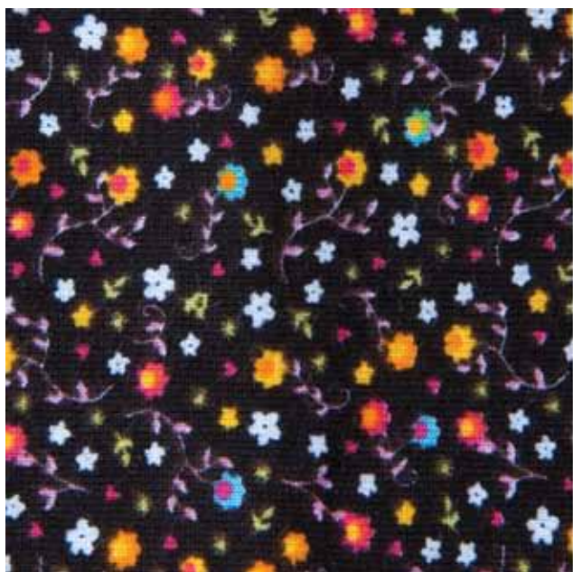
Cecile Elise Sabella, 2008 Limited edition of artist books and prints