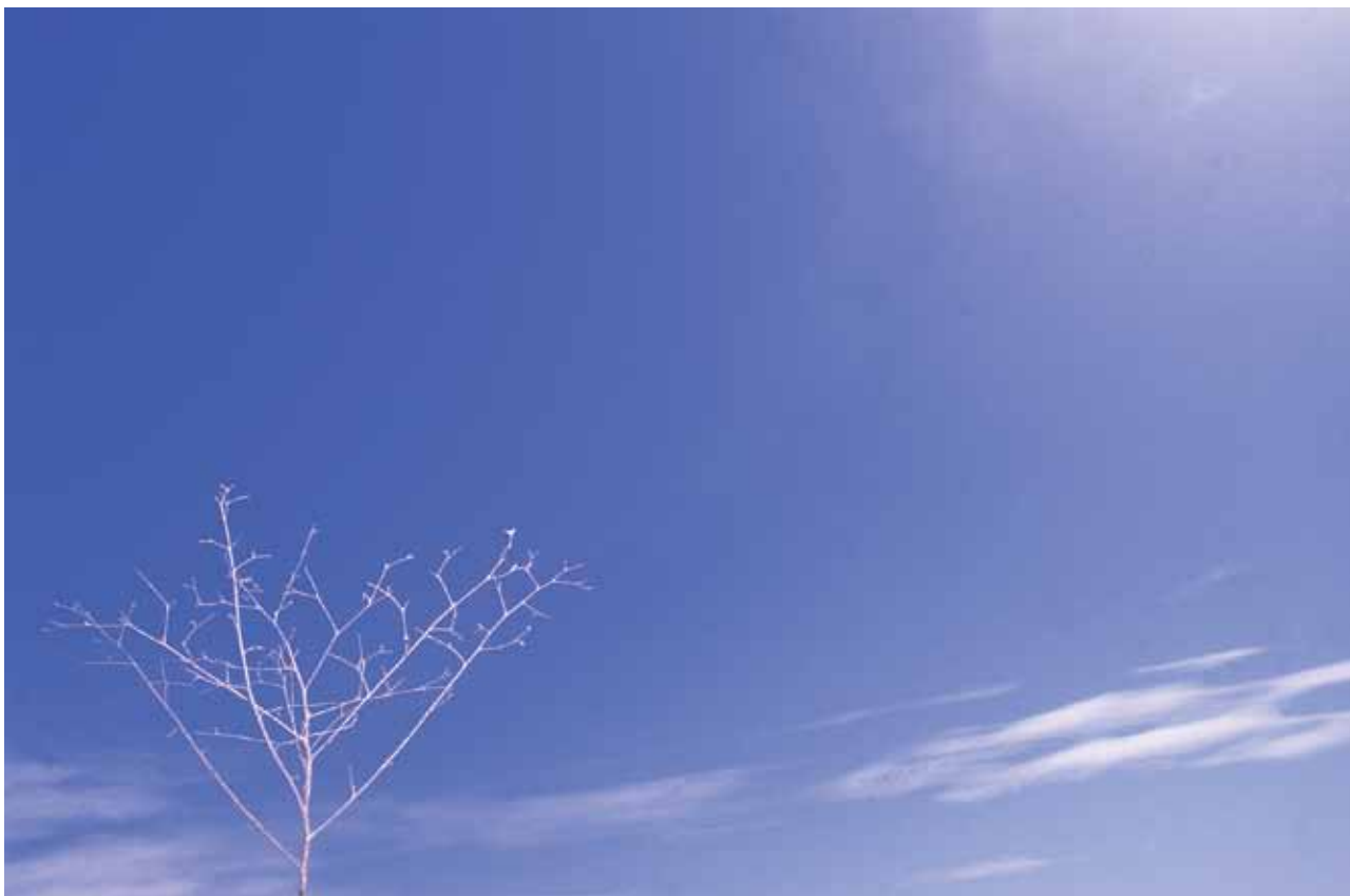
Identity , 2002 colour transparencies, 40/50 cm

The pieces that form this series speak of a childhood Sabella never had, they speak of transformation of context to content, and they ruminate on suffering and home and loss. But amidst his conveyance of confusion, alienation even, in the alternate sides of fabric that look in many ways like they have no link to each other at all, the work also speaks of dialogue and the reality of connectivity even in the face of difference and change. And it was perhaps this moment of discovery of the physics and science of the other side that allowed Sabella to create the realities that form In Exile (2008). It was, one wants to believe, in that fleeting moment by the window looking out, that he looked out on a world, however faulted, that could form a whole.