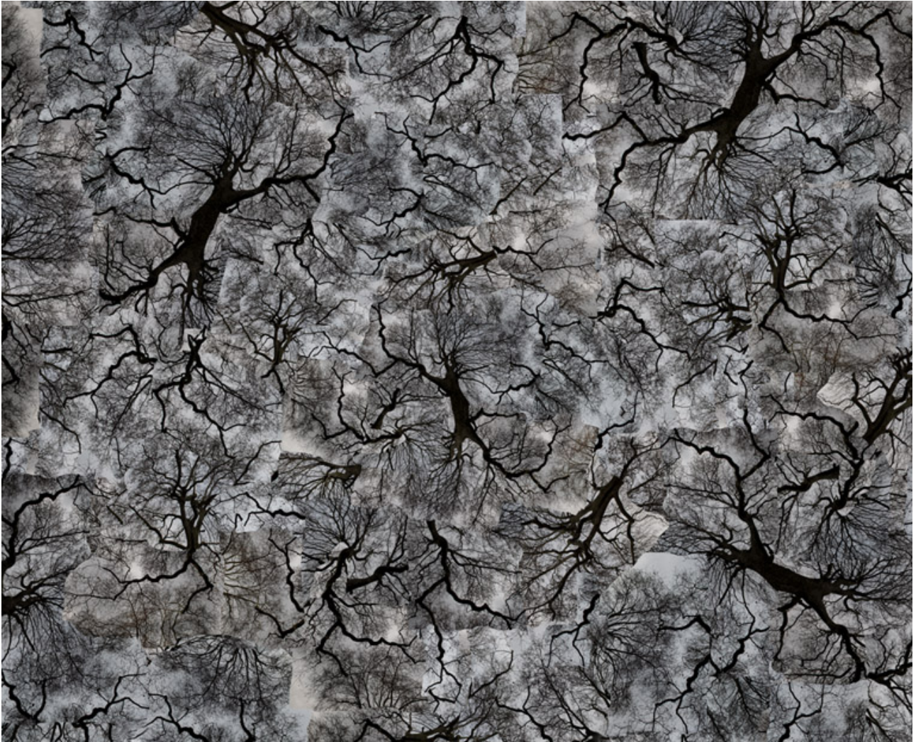
Steve Sabella, Euphoria , 155 cm / 125 cm, 2010

In contrast, the Euphoria triptych is a joyous retinal explosion. Cut and assembled from hundreds of fragments of trees, like those shown In Transition , the resulting photomontages of organic fluidity emanate cathartic relief and a transcendence of the state of 'mental exile.' Long years of self-interrogation have given way to a more stable personality, one open to expansion and to the appreciation of beauty and the sublime. It is also relevant that the production period of Sabella's first post- Euphoria works coincided with the demonstration in Tunisia and Egypt. Beyond Euphoria relishes in a freedom never seen before in Sabella's oeuvre, a freedom where possibilities are limitless and new fictional spaces beckon to be explored.