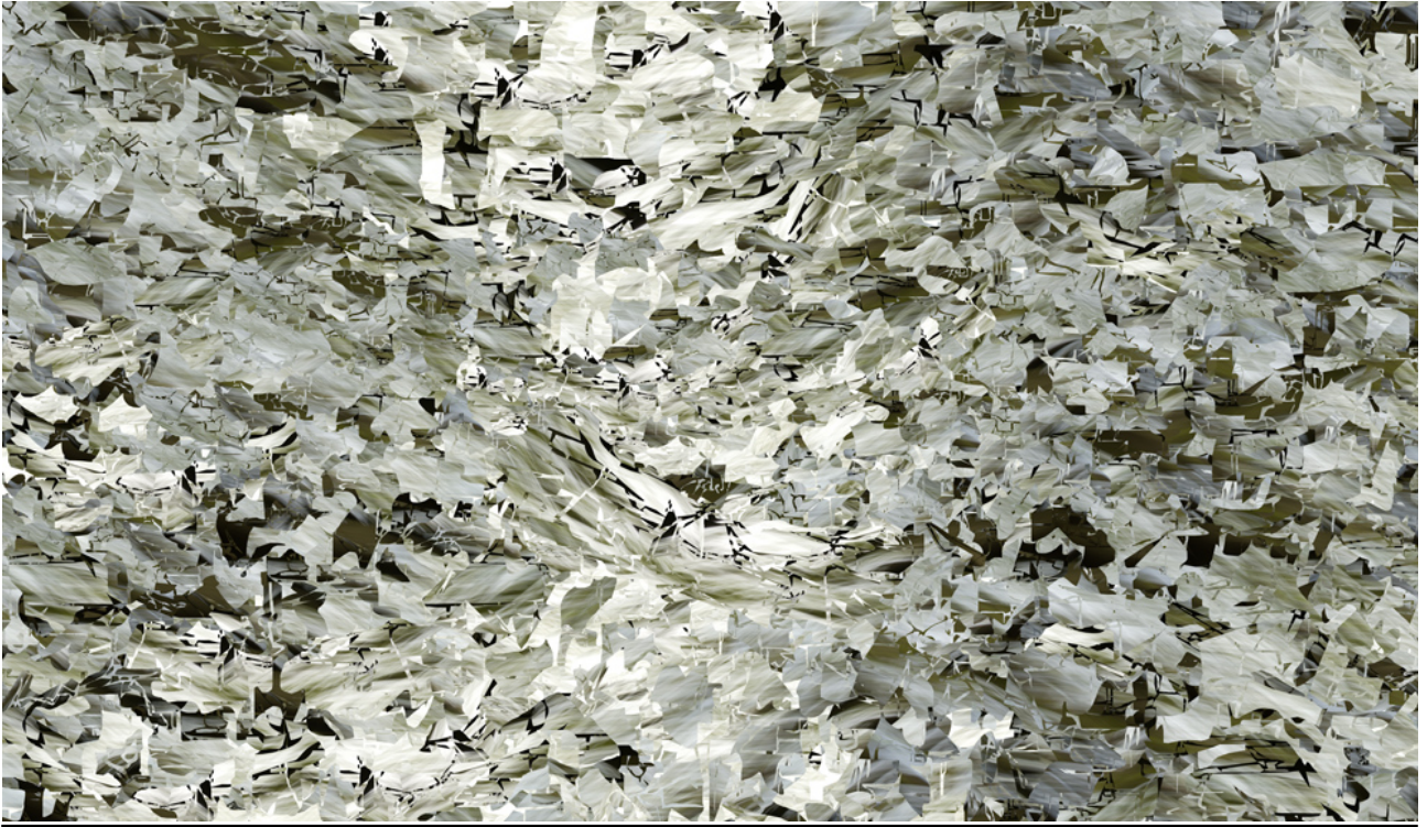
Steve Sabella, Beyond Euphoria, 205 cm / 117 cm, 2011

note: all slanted words are hyperlinked in the article