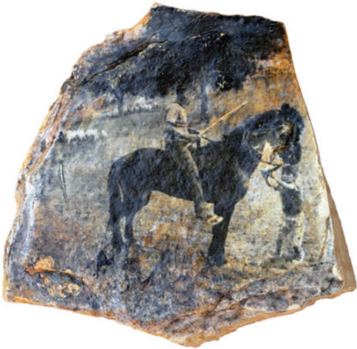
Steve Sabella, Till the End , Photo Emulsion on Stone, 2004, Unique, British Museum Permanent Collection

The following year, Till the End - Spirit of Place was conceptually expanded into a monumental collaborative undertaking, gathering images and memories of Jerusalem as remembered by Palestinians globally. The results were to underscore the artist's hypothesis: that Jerusalem had been exiled and replaced by a hyper-real construct, a simulacrum deployed in the name of ideology which, not only intended to destroy the plurality of the city but, ultimately, aims to colonize the imagination. The corroboration of his long held suspicions left the artist in a state of near physical and mental collapse.