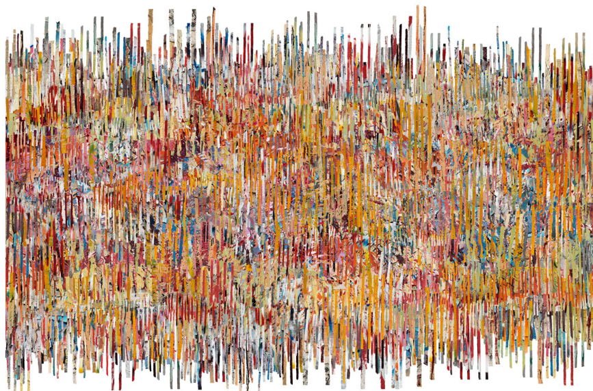
Sinopia I (2014)